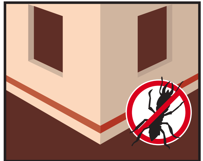
Use as a Sill Flashing or Termite Barrier